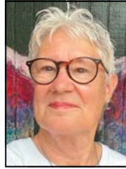
Vice President Membership