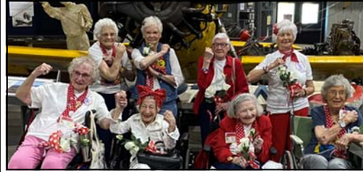
Some of our beautiful Rosies enjoying the 2022 Convention in Tulsa, OK

Rosies, we want you to come to Portland and join in the fun! If you are a World War II Rosie, ARRA will reimburse you for $200 of your travel expenses.