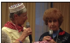
Rosies, Rosebuds, Rivets, and guests at the 2015 Convention