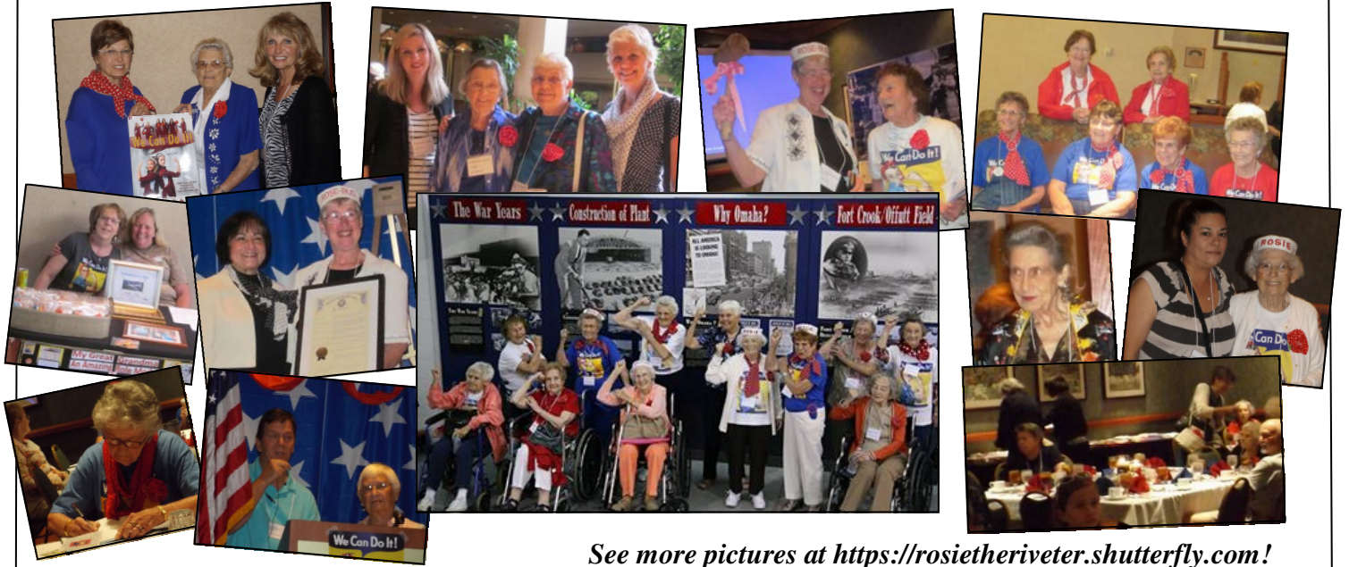
See more pictures at https://rosietheriveter.shutterfly.com/ !