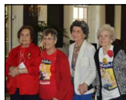
Detroit Convention 2013

Have you seen our Web site? There you can find announcements, back issues of Rosie's Mail Call , an application form to join ARRA, Rosie stories, links to other sites of interest to Rosies, and more!