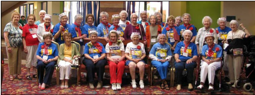
What a lovely group of Rosies at the Phoenix Convention 2012!!