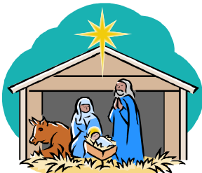
Wise men still seek Him!

Each day, with its blessings, is a present from God. That's why it's called the Present!