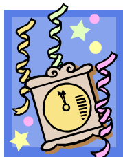
A New Year - A New Beginning

Until one finds the Spirit of Christmas, there is no Christmas. It's the warmth that comes to the hearts of men When the Christmas Spirit returns again.