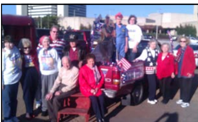
Some of the Birmingham Chapter members in the Birmingham Veterans Day Parade.