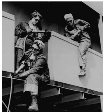
National Archives 86-WWT-85-16

Stories should be typed and double-spaced. There is no special length requirement for the Archives, but if a story is selected for publication in a book of Rosie stories in the future, it should be 300-350 words long with two pictures, or 400-450 words long with one picture. Be sure to identify people in the pictures, especially the Rosies, and tell the setting of the pictures on a