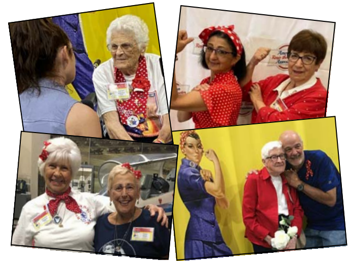
<u>A Reflection</u>: "It was such an honor and privilege to attend the ARRA Convention as the Fayette County, WV Chapter President. It was wonderful to meet the other Chapter Presidents, and very exciting to hear what other Chapters are doing to continue the Rosie legacy. I was so thrilled to meet new Rosies! I loved their spirit and spunk!"

See more great pics at rosietheriveter.shutterfly.com !