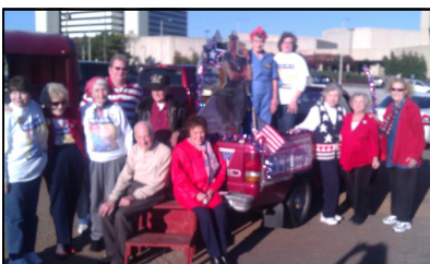
Some of the Birmingham Chapter members in the Birmingham Veterans Day Parade.