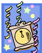
A New Year - A New Beginning

Until one finds the Spirit of Christmas, there is no Christmas. It's the warmth that comes to the hearts of men When the Christmas Spirit returns again.