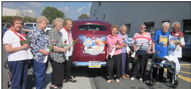
Looking good, Maryland Rosies!